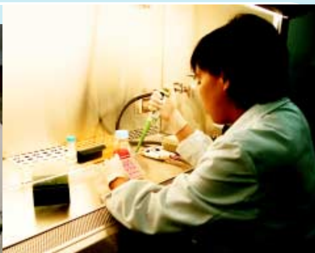
▲ Application of RAPD for authentication of Chinese medicine at genome level