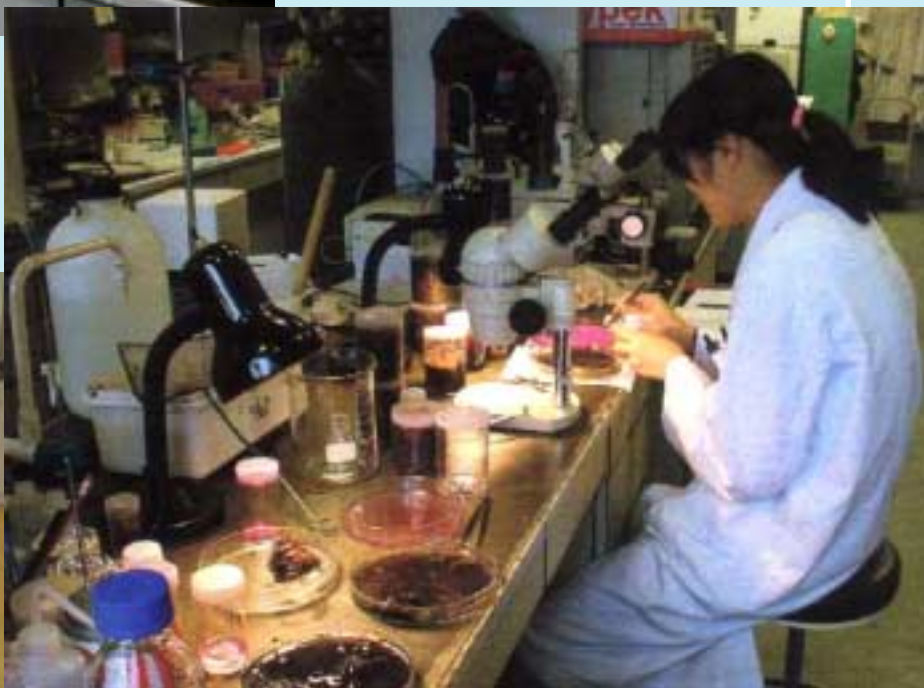
◀ ▲ Snapshots of the University's Joint Open Laboratory on Pearl River Delta Environmental Research