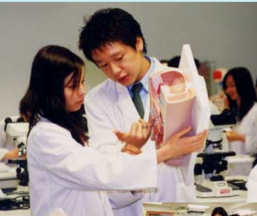
◀▼ Group discussions in Chinese Medicine classes