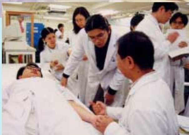
◀ Teachers and students conducting Chinese Medicine research