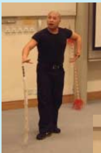
▲▶ Demonstrations by Kunqu Opera masters at a seminar on traditional Chinese culture